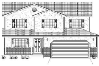
283 East 2110 South

2,108 Total Sq. Ft. (1,484 Finished) 4 Bedrooms • 2.5 Baths .13 Acre Lot