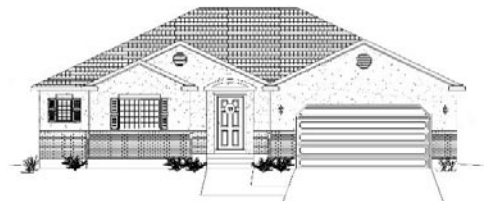
351 East 2110 South

2,812 Total Sq. Ft. (1,406 Finished) 3 Bedrooms • 2 Baths .18 Acre Lot